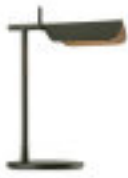
Table and floor lamps providing direct lighting with adjustable head. Body in painted pressofused aluminium. Multi-led diffuser in specially designed PMMA to avoid the Multi Shadoweffect and dazzle. Head rotation from \pm 90^\circ .

Designed by Edward Barber and Jay Osgerby